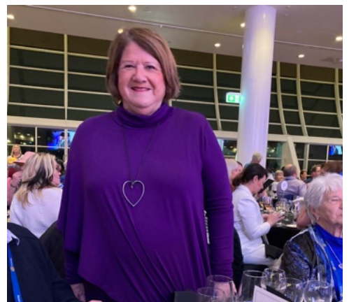
Captain of our table at "The Race That Stops a Nation"