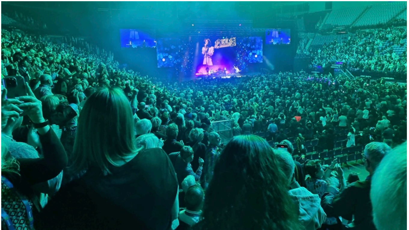
At the Rod Laver Arena