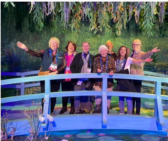
At the Monet Exhibition at The Lume