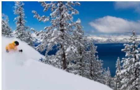
Lake Tahoe, Nevada

Oddly they were staying in Burradoo in a house owned by a member of their club in Nevada!