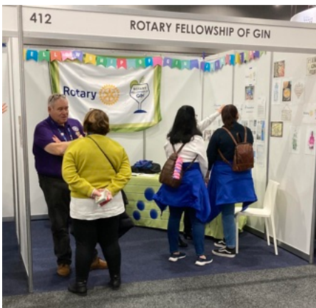
"No Rosemary, no free samples here!"